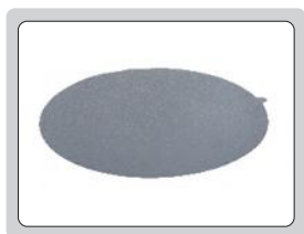
silicon carbide paper(included)